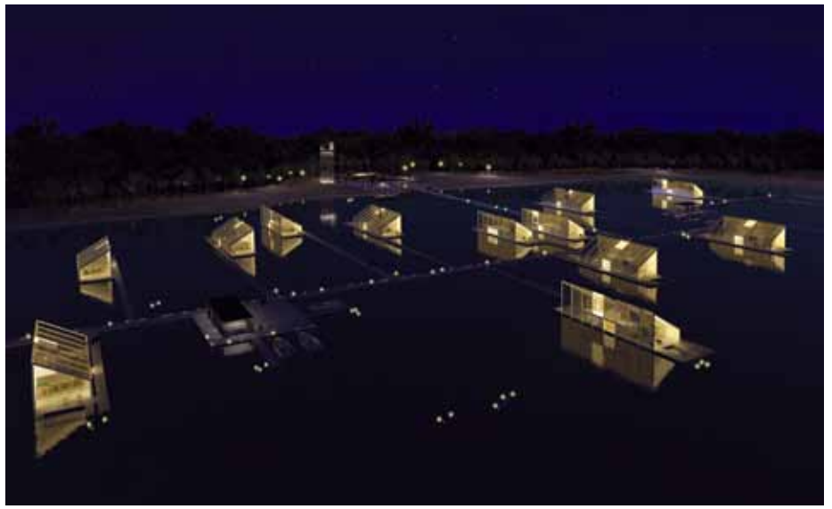
At night, the villas resemble floating lanterns

The resort is surrounded by a tropical jungle of vegetation and unexplored lands characteristic of Myanmar and its islands. The structures are placed in the context with care to reduce any negative impact on the natural environment. The materials used (bamboo, wood and textiles) come from local manufacturing and the light and permeable structures blend in the lanscape, free to