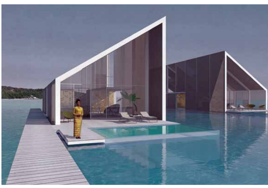
Villa's private terrace with glass swimming pool

Located in the Southern most part of the Pyin Sa island, in Myanmar, RRC has developed a luxury resort consisting of three main structures that host the main hospitality activities: the hotel, the restaurant, and the gym & spa. These are connected by light weight, wooden corridors that run over the water, extending from one point of the beach to the other. Along them, other functions develop, such as a fishing and diving center, a boat clubhouse, and a seaplane and ship base to manage the arrivals from air and sea. Smaller corridors branch out to access each of the floating villas, providing privacy, unique views, and a sense of total integration in the environment.